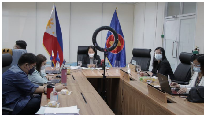
The Philippines, through DOTr-MARINA, during the the 41st ASEAN Maritime Transport Working Group (MTWG) Meeting.

human and social interventions including full support to the Hatid-Tulong Program, Balik-Probinsya Program for returning seafarers, Overseas Filipino Workers (OFWs) and Locally Stranded Individuals (LSI), Balik-Probinsya Program for the employees of the Philippine Ports Authority (PPA), Hatid-Estudyante Para Makabalik sa Probinsya Program, prevention, control and mitigation of the spread of the coronavirus in PPA offices and facilities, conversion of passenger ships into temporary quarantine facility for returning seafarers and OFWs, conversion of port facility into a medical facility, and launching of Emergency Operations Center (EOC).