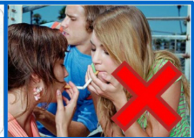
No youth purchase