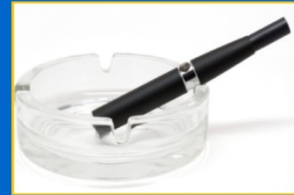
ELECTRONIC SMOKING DEVICES also known as e-cigarettes